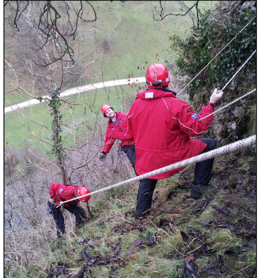
BUSY WEEKEND... volunteers from Derby Mountain Rescue team.

Follow the Ashbourne News Telegraph on Twitter and get the latest news @ashbournenews